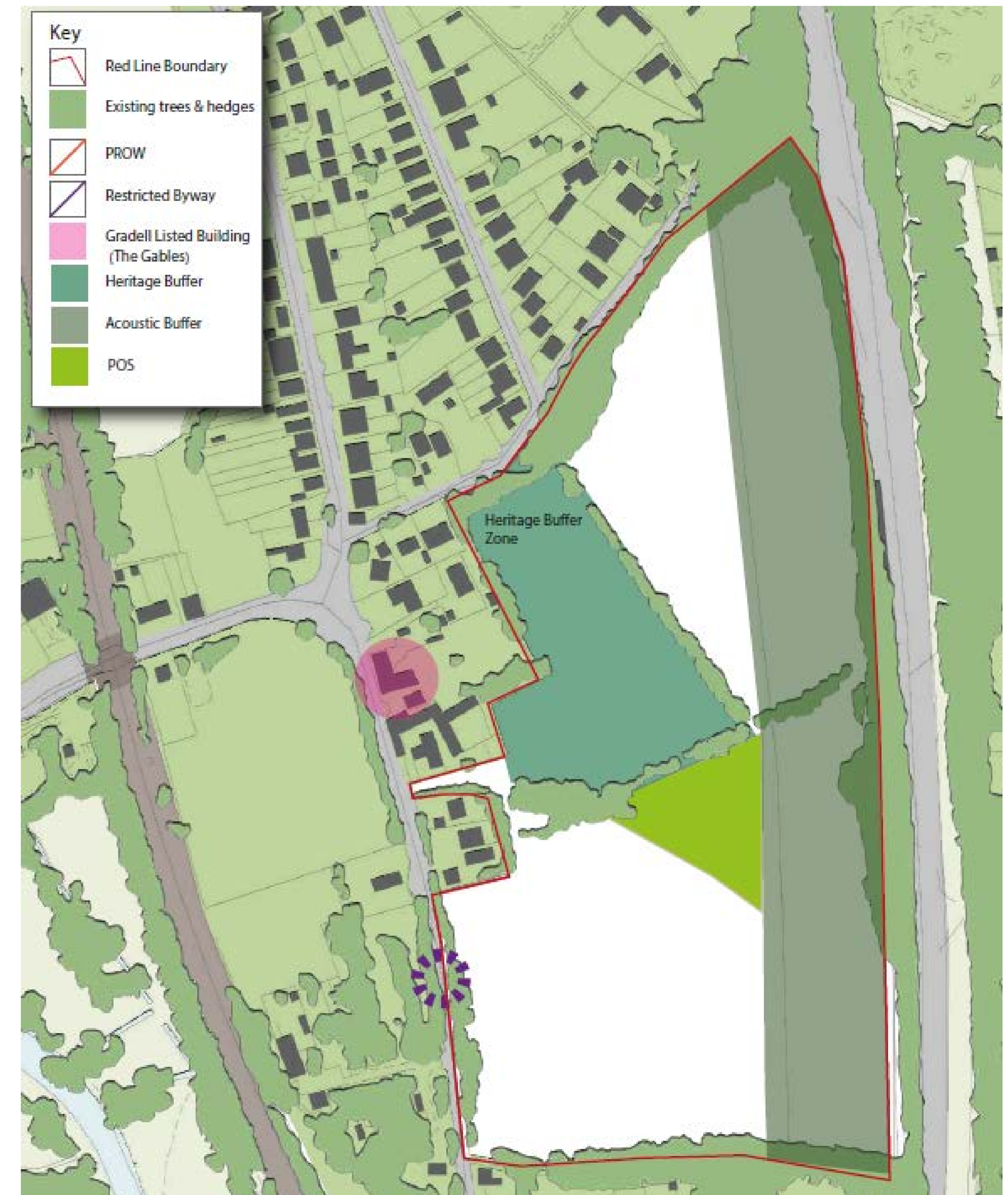
Figure 7: Proposed Landscape Plan